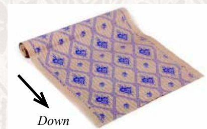
Figure a) Direction of pattern

Non excess pattern must be trimmed at the absolute edge of the pattern on the overlapping length. Pattern refers only to the decorative pattern. Disregard edge markings such as lines, dots, arrows and text etc.